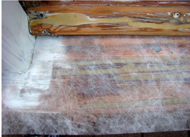
Press the cloth in the still wet Renofix Oranje