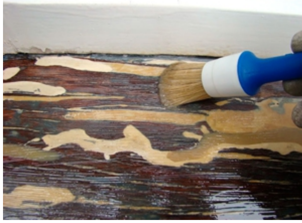
Apply a layer of Renofix Oranje